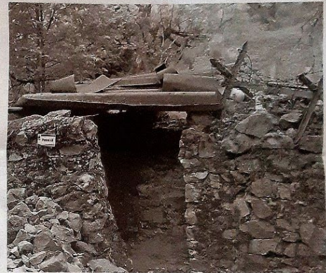
The HWK Paths of Remembrance