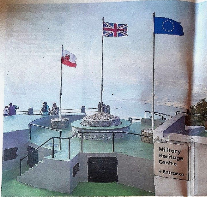
Gibraltar, UK and European Union flags at Gibraltar