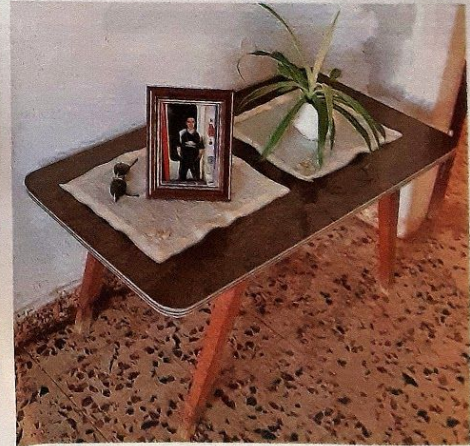
A home scene in Cyprus