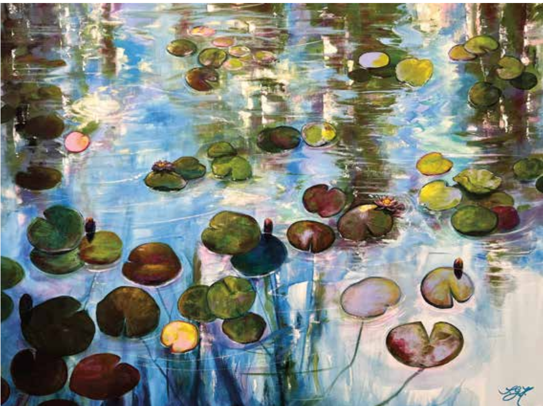
Water Lilies At Sunset 5 , acrylic on wooden stretched canvas, 23½ x 31½ x ¾" (60 x 80 x 2 cm)

This scene depicts a pond of water lilies in Hamburg, Germany. The sunlight and trees are reflecting on the blue shining water. I never know exactly what is underneath the water. The lilies always give a "wow" feeling. The blossoms are so strong and almost lordly—so confident while they float with their leaves on the surface.