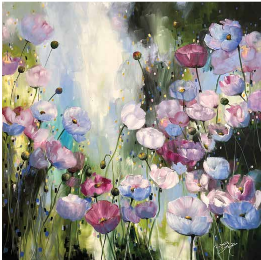
Poppies Land 1 , acrylic on wooden stretched canvas, 31½ x 31½ x ¾" (80 x 80 x 2 cm)

At my second studio a poppy field is nearby. I can stand there forever watching the wind and sunlight making their way through the dancing blossoms, creating reflections here and there.