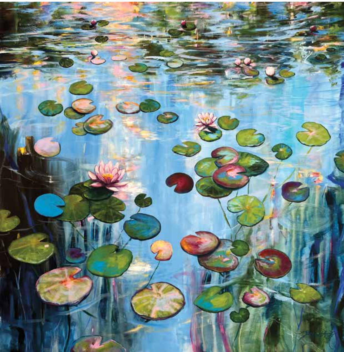
Floating 5 , acrylic on wooden stretched canvas, 39 ¼ x 39 ½ x ¾" (100 x 100 x 2 cm)

The first picture I bought for my room when I was 14 years old in my parents' house was a poster of Claude Monet's water lilies in Giverny, France. I love the peace I feel when I sit by a pond of water lilies, just watching and listening. Within my paintings, I strive to capture the reflection of the sunlight on the slowly moving water. My water lilies are more like a little fairy tale, some parts are real like in nature, others are just what I see in my imagination. I love the mix of it.