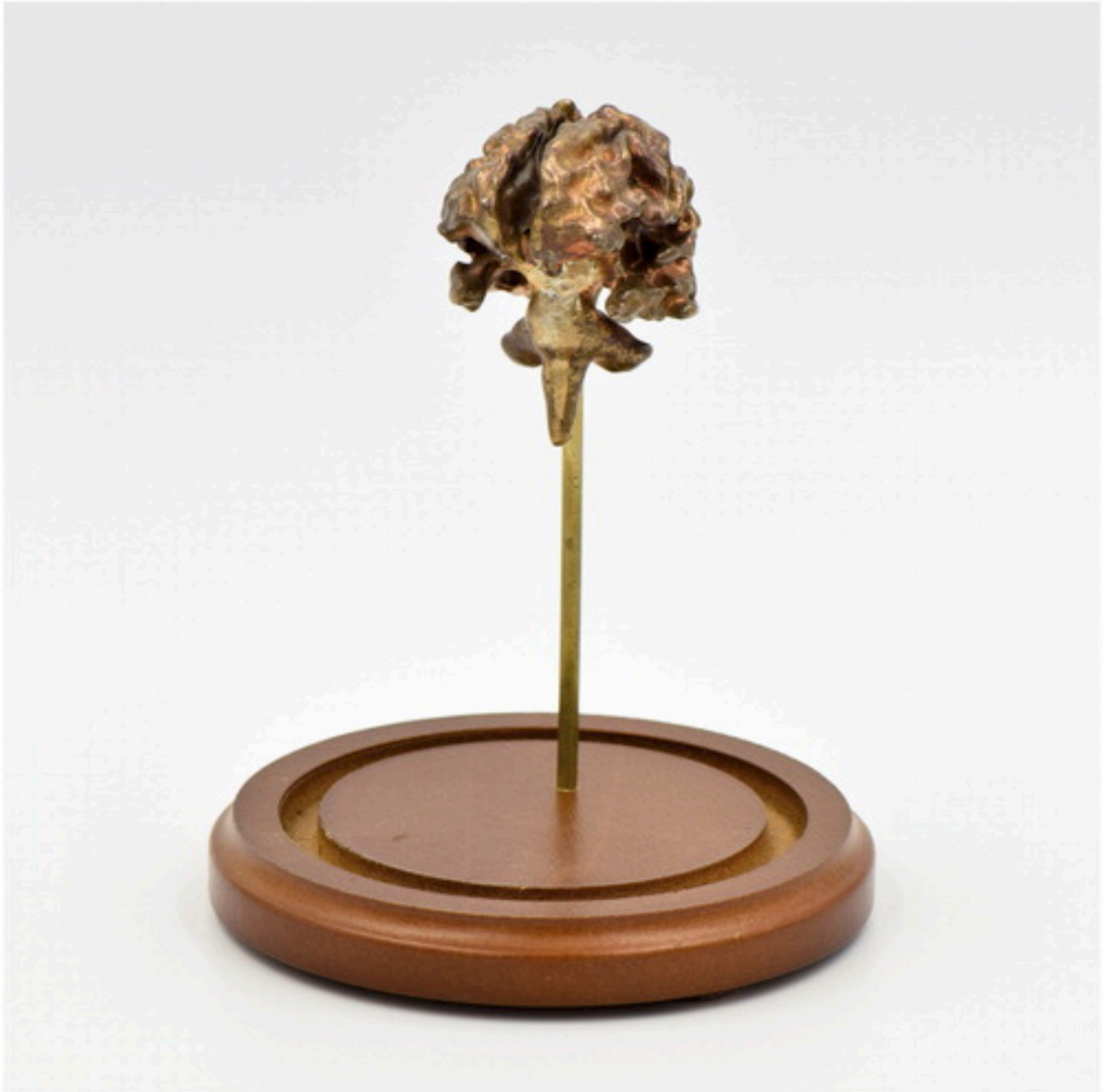
Brain White Matter Sculpture.