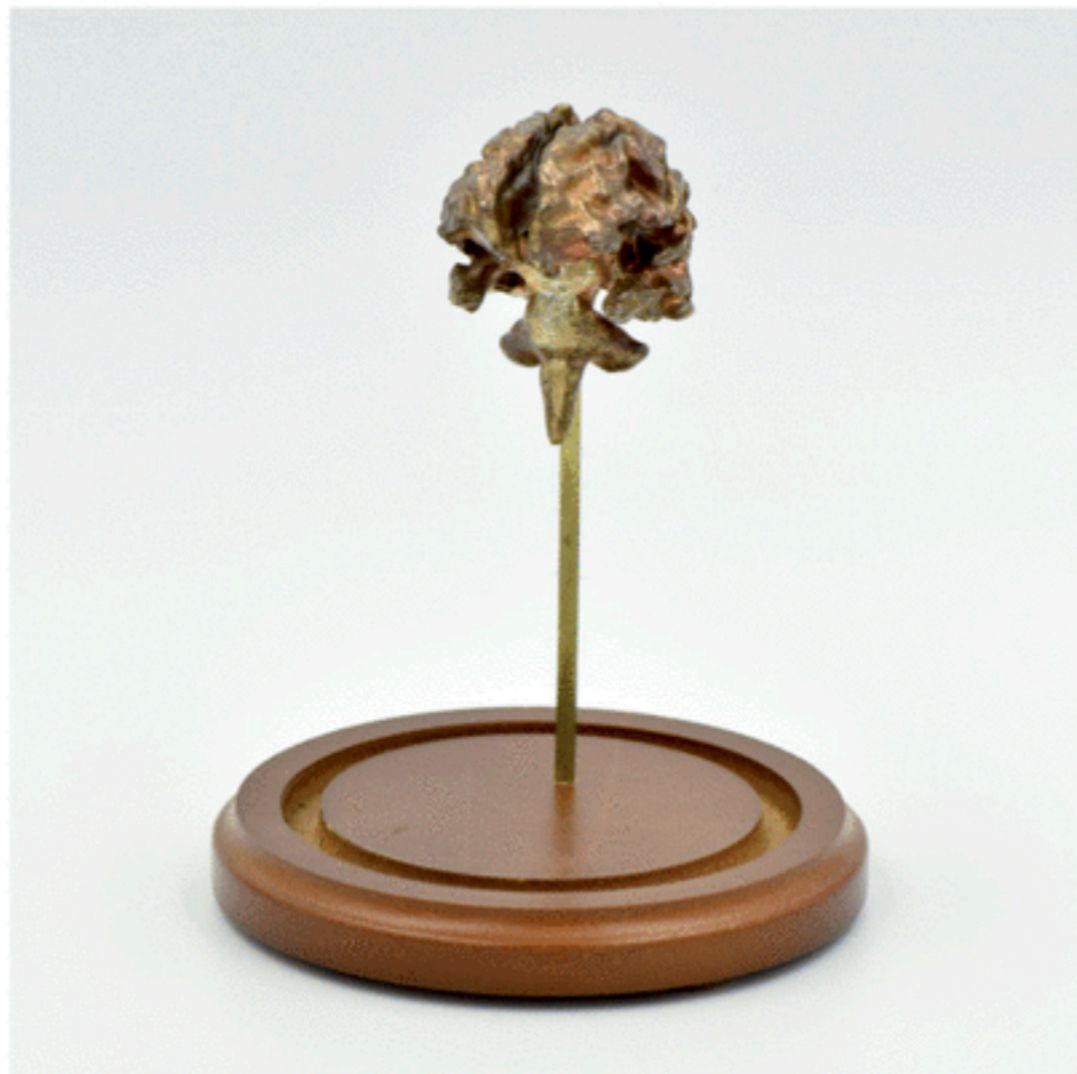
Brain White Matter Sculpture.

The results were miniature sculptures, each a 'memento mori' or remembrance of the death of the individual and of the species. Being mindful of death is of course a way to celebrate life, both of the individual and the species.