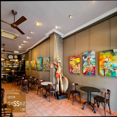
Galeria passage Ayamonte-Spain february 18-march 3 2021