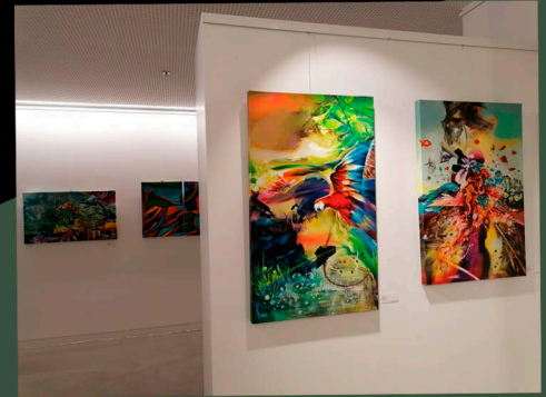
espaço Atmosfera Lisboa-Portugal July-august 2020