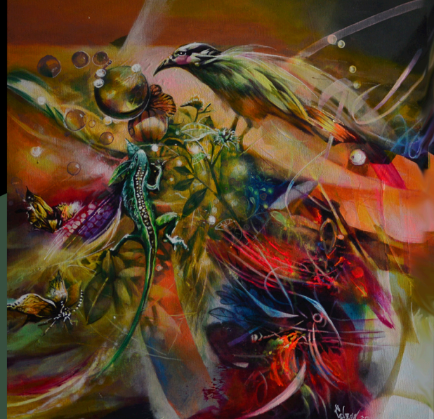
Chasing Butterflies Acrylic on canvas 50 x 50 cms 2020

Artist's contact: 00351 911087493-calerojorge@gmail.com https://www.facebook.com/theartofjorgecalero