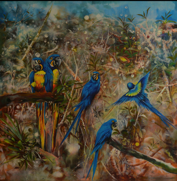
Jacintas Acrylic on canvas 80 x 80 cms 2020